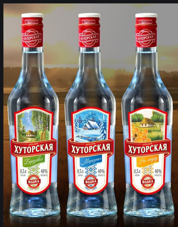
Vodka Khutorskaya Berezovaya, Khutorskaya Moroznaya, Khutorskaya na Medku